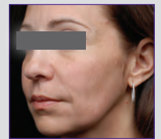
Immediately after one treatment

All Before and After photographs are of real patients, your results may vary.