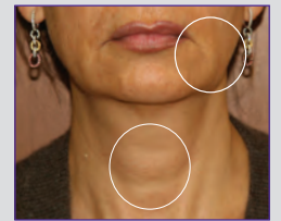
After 6 treatments