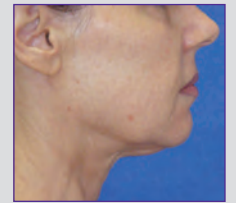
6 months follow up